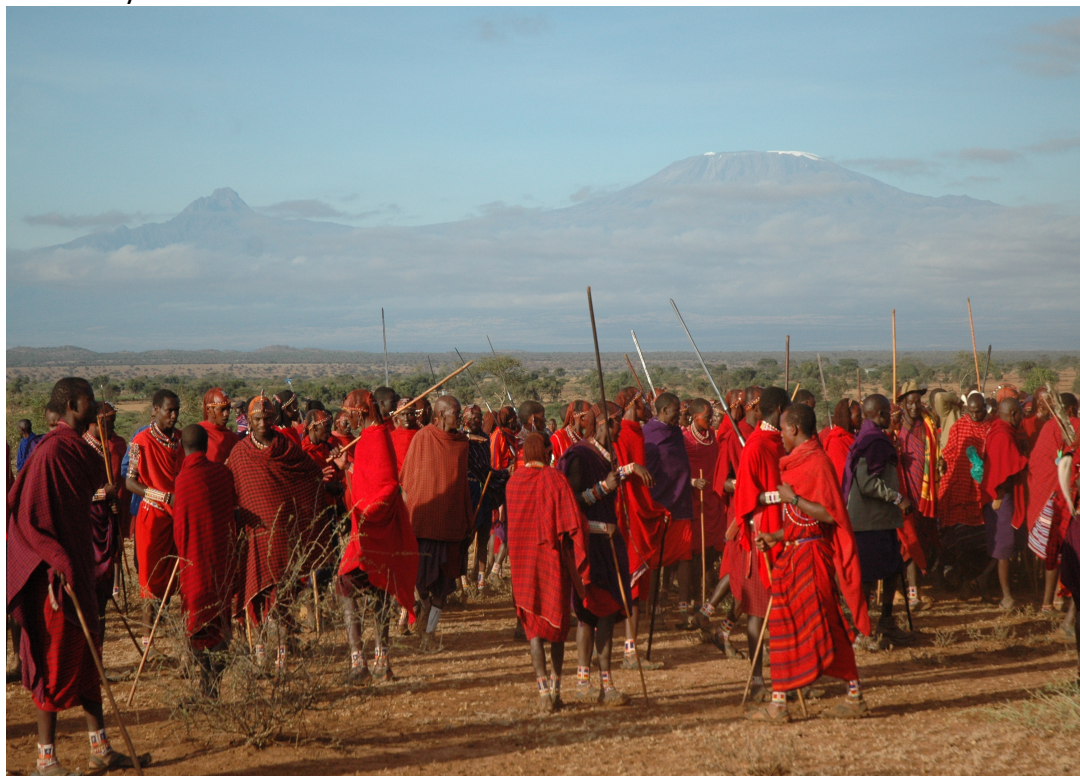
Photo: Maasai Warriors attend a Maasai Olympics team selection exercise on MGR, in April, 2014

We are still continuing with fundraising efforts for Maasai Olympics. Unfortunately the lack of funds has seen a change in the plans, with prizes for team selections struck out and number of officials, who oversee the team selections, cut down drastically from 7 to 2.