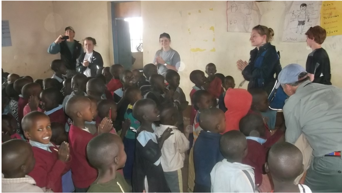
Photo: Enkijape School students with visiting Highland School