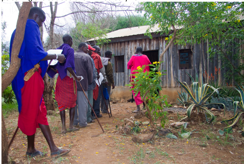
Photo: Queues at the OGR payout in May

Members of Olgulului zone (a zone within OGR) forfeited predation claims for March and April 2014 in order to pay the penalty of KSh 140,000 resulting from the poisoning of a sub adult lion in February 2014.